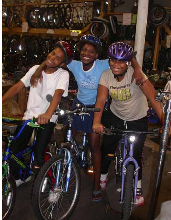
Some Madison girls pick up their Earn-a-Bikes.