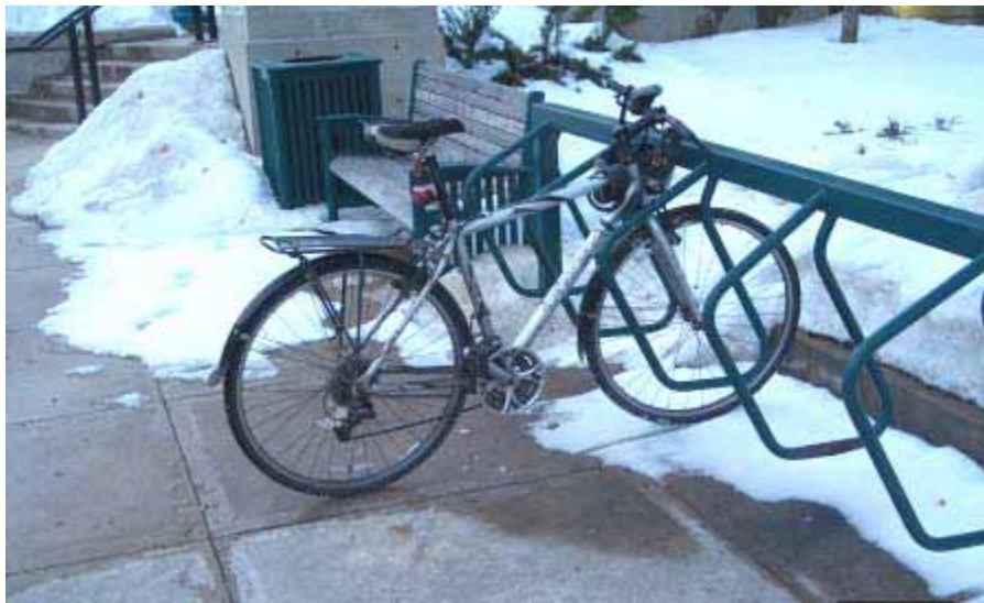
Bike Rack in Winter. Image: Arthur Ross