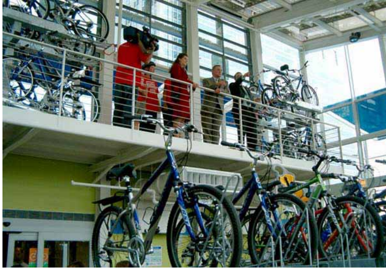
Bike Station.