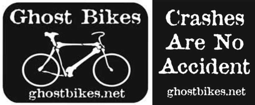
Ghostbike Project.