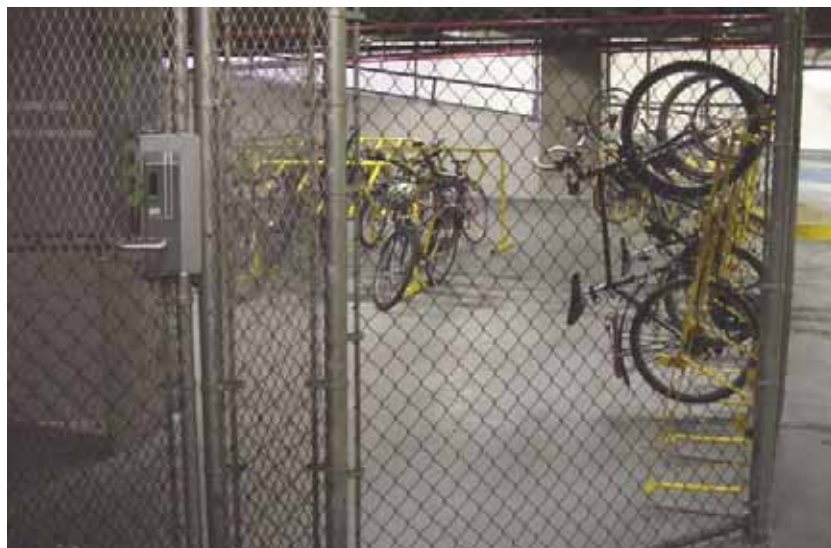
Bike Cage. Image: Arthur Ross