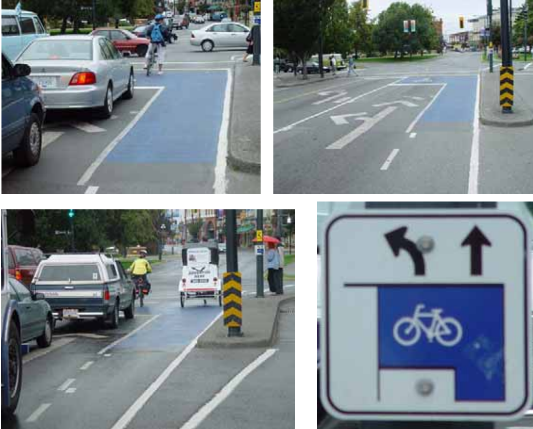
Bike Box, Victoria, BC.