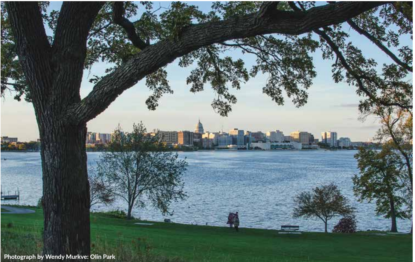
Olin Park