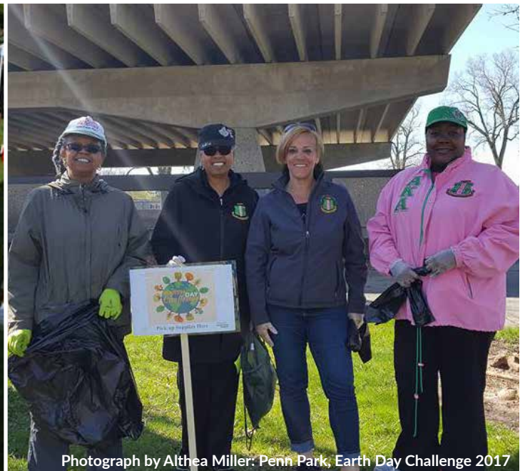
Penn Park, Earth Day Challenge 2017