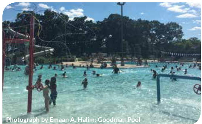
Goodman Pool

Our mission is to provide the ideal system of parks, natural resources, and recreational opportunities which will enhance the quality of life for everyone.