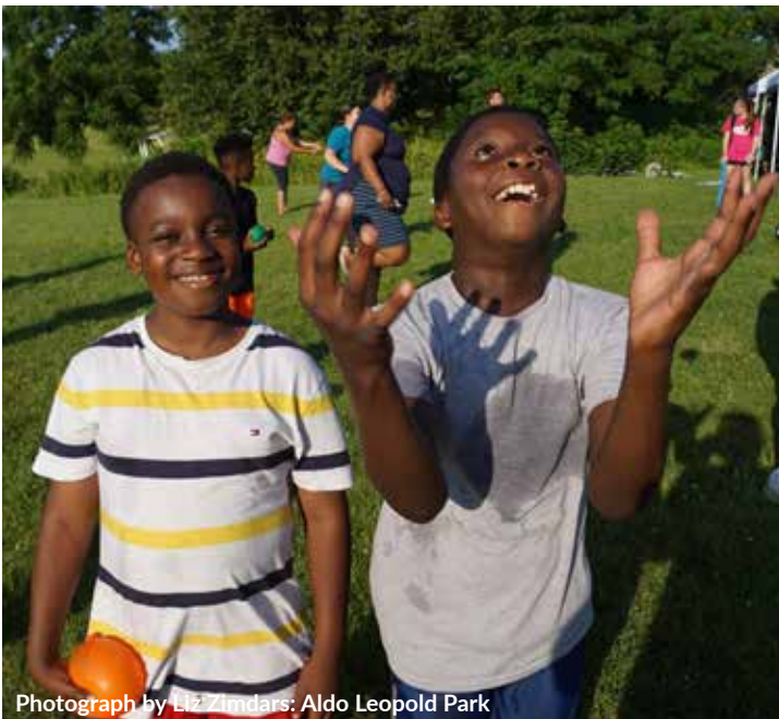
Aldo Leopold Park