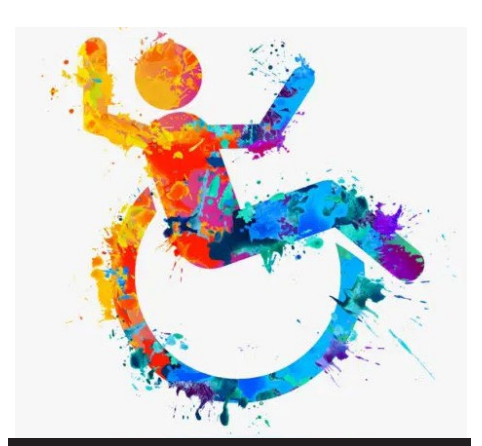
July is Disability Pride Month