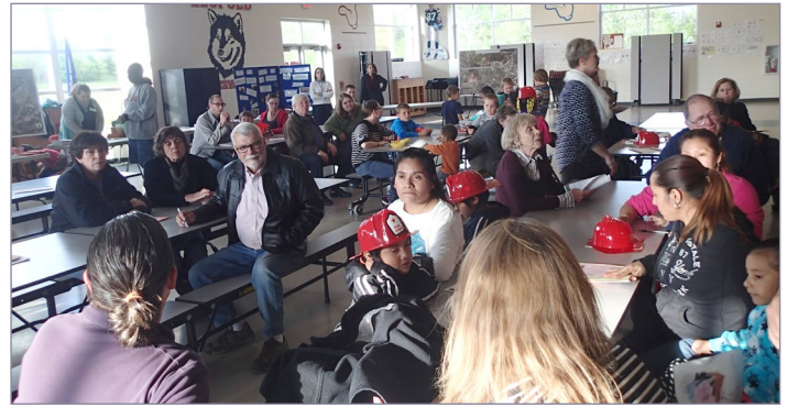
Leopold’s Community Suppers bring a diverse group of residents together for food and conversation.

“Our NRT meetings often include 15-20 people, but there is a larger group of people who are very connected