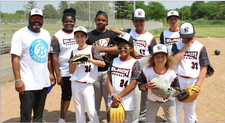
The Black Men Coalition of Madison's Youth Baseball League plays at Elver Park and benefits from the Qualifying Discount Program.