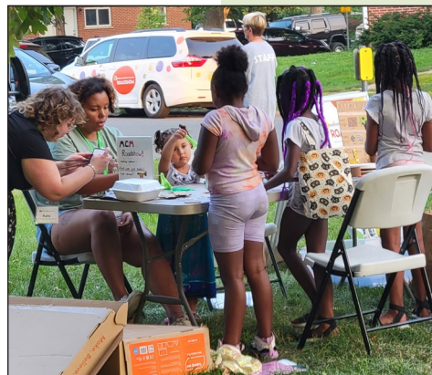
Far left: Brentwood Parks Alive attendee interacts with Metro’s display; left: Brentwood residents engage in group activities.