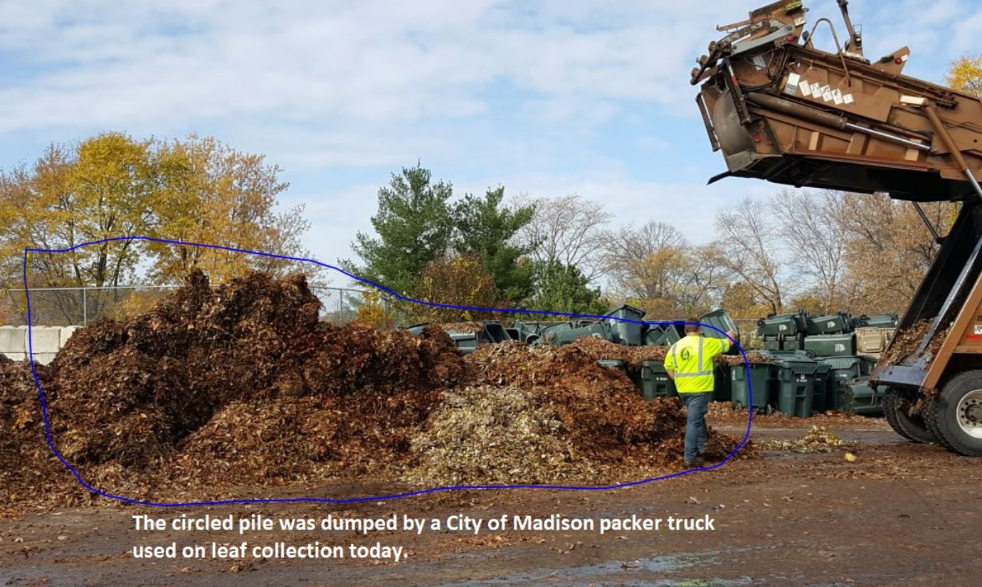
The circled pile was dumped by a City of Madison packer truck used on leaf collection today.