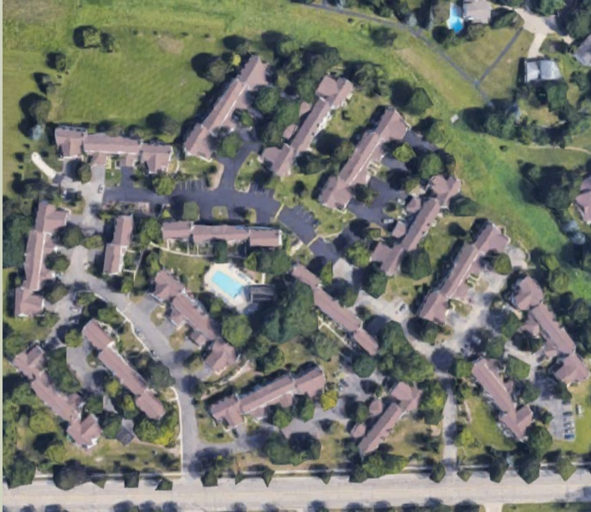
The above snip is of a condo complex off Old Sauk Rd. One of several similar developments in Madison.

I live on a private street, and I pay property taxes. I do not believe it is fair that I cannot receive public solid waste collection on my private road.