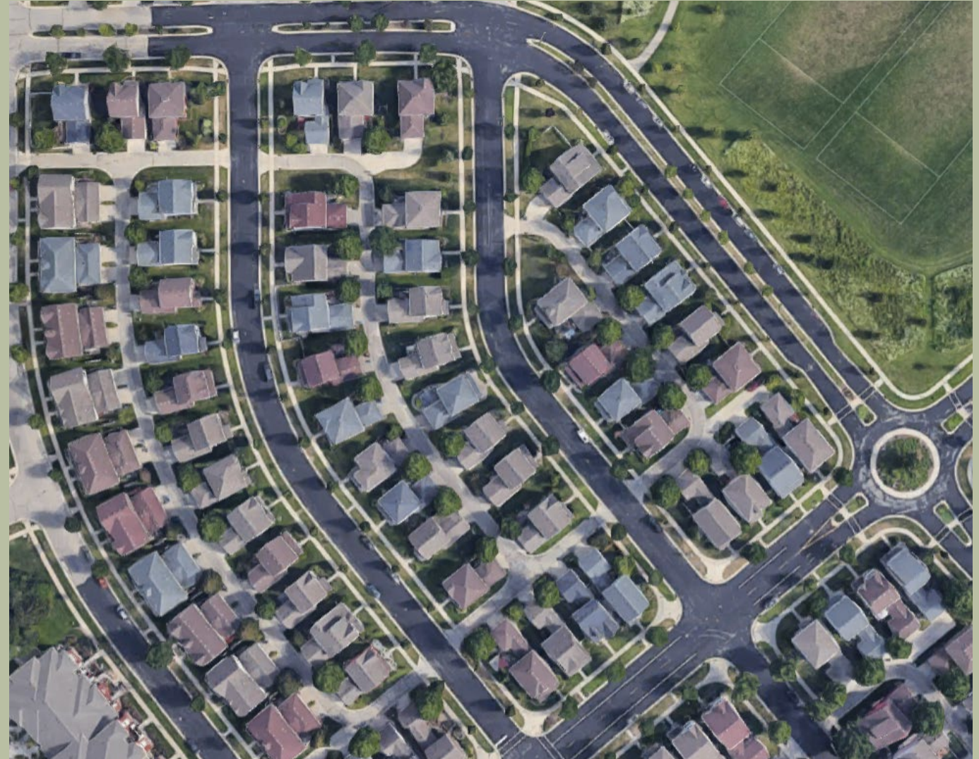
Above snip from development on far east side of Madison. One of several similar developments in Madison.