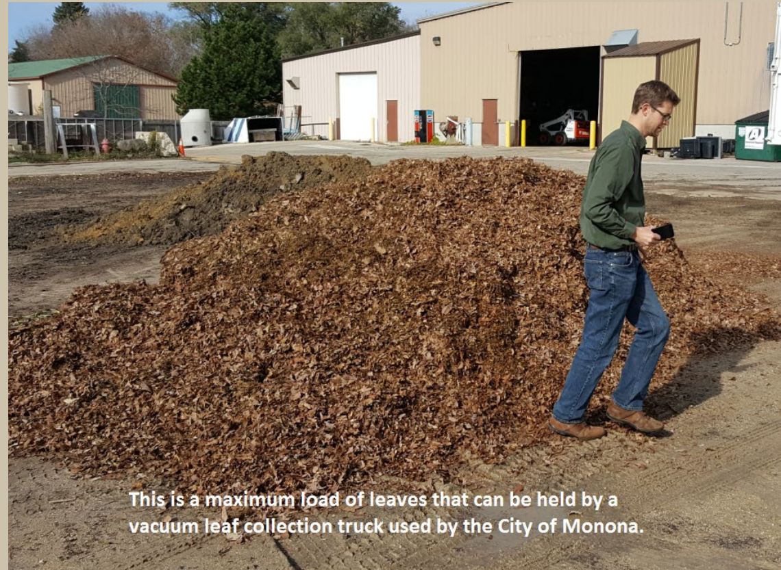
This is a maximum load of leaves that can be held by a vacuum leaf collection truck used by the City of Monona.

Why doesn't the Streets Division use leaf collection vacuums?