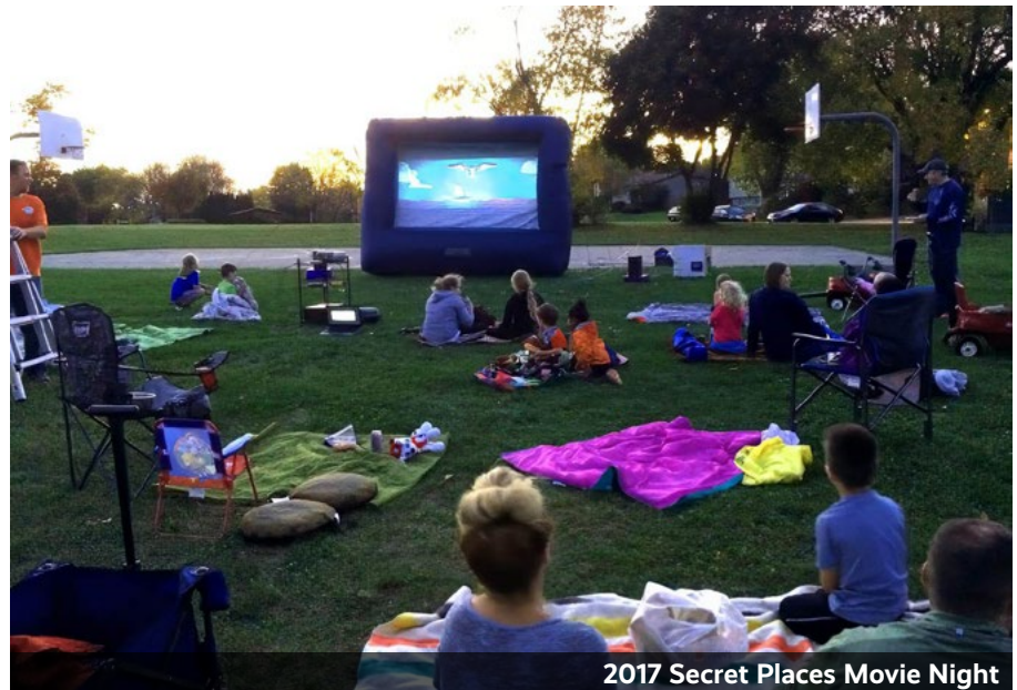
2017 Secret Places Movie Night