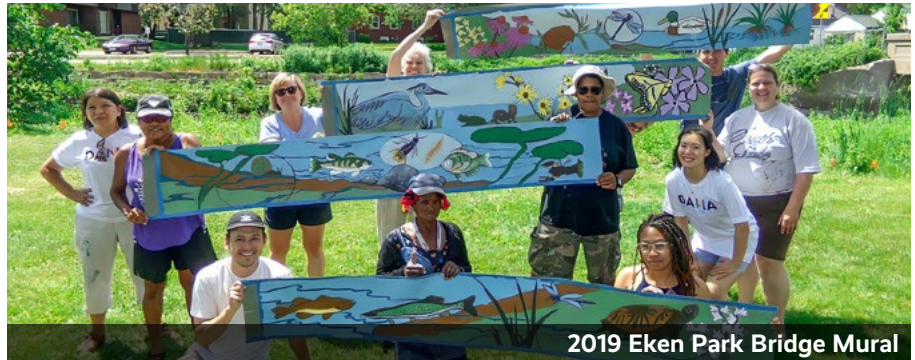
2019 Eken Park Bridge Mural