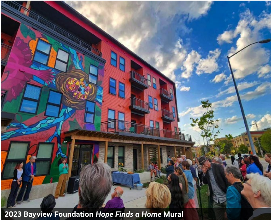
2023 Bayview Foundation Hope Finds a Home Mural