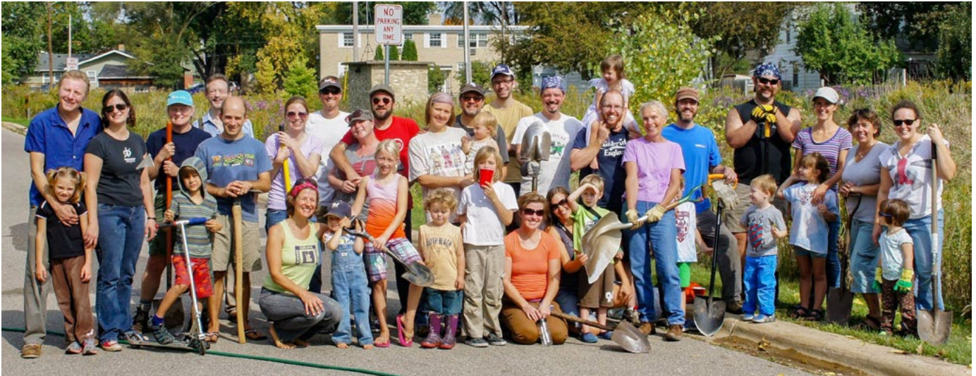
2015 SASY Union Triangle Street Mural