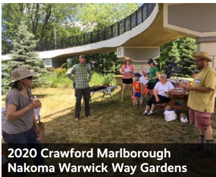
2020 Crawford Marlborough Nakoma Warwick Way Gardens

The Neighborhood Grant Program of the City of Madison Planning Division helps residents and organizations that support neighborhoods with projects that beautify public spaces, create public gathering places, or build organizational capacity and leadership skills. The grant program provides funding but neighbors' ideas, determination and pride are behind the most successful projects. In 2025, the City expects to award $25,000 in grants.