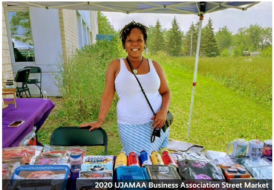
2020 UJAMAA Business Association Street Market