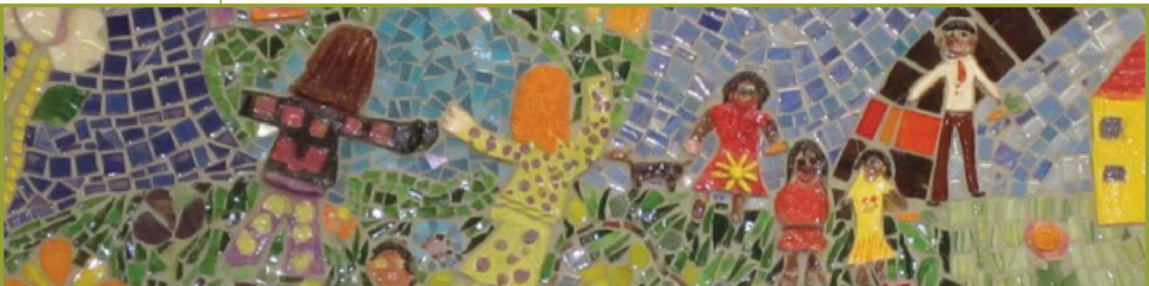
Mural, Villager Mall Atrium

As a result, artists and creative workers have no ongoing, interdisciplinary gathering place where collaborative ideas and invention are free to grow. Similarly, there is no place for cultural institutions to come together for common purposes such as marketing, special event scheduling, equipment and space sharing, or development of community-wide programs. The business and philanthropic sectors have no ongoing, structured opportunities for education, recruitment, or joint planning around specific matters of creative sector investment.