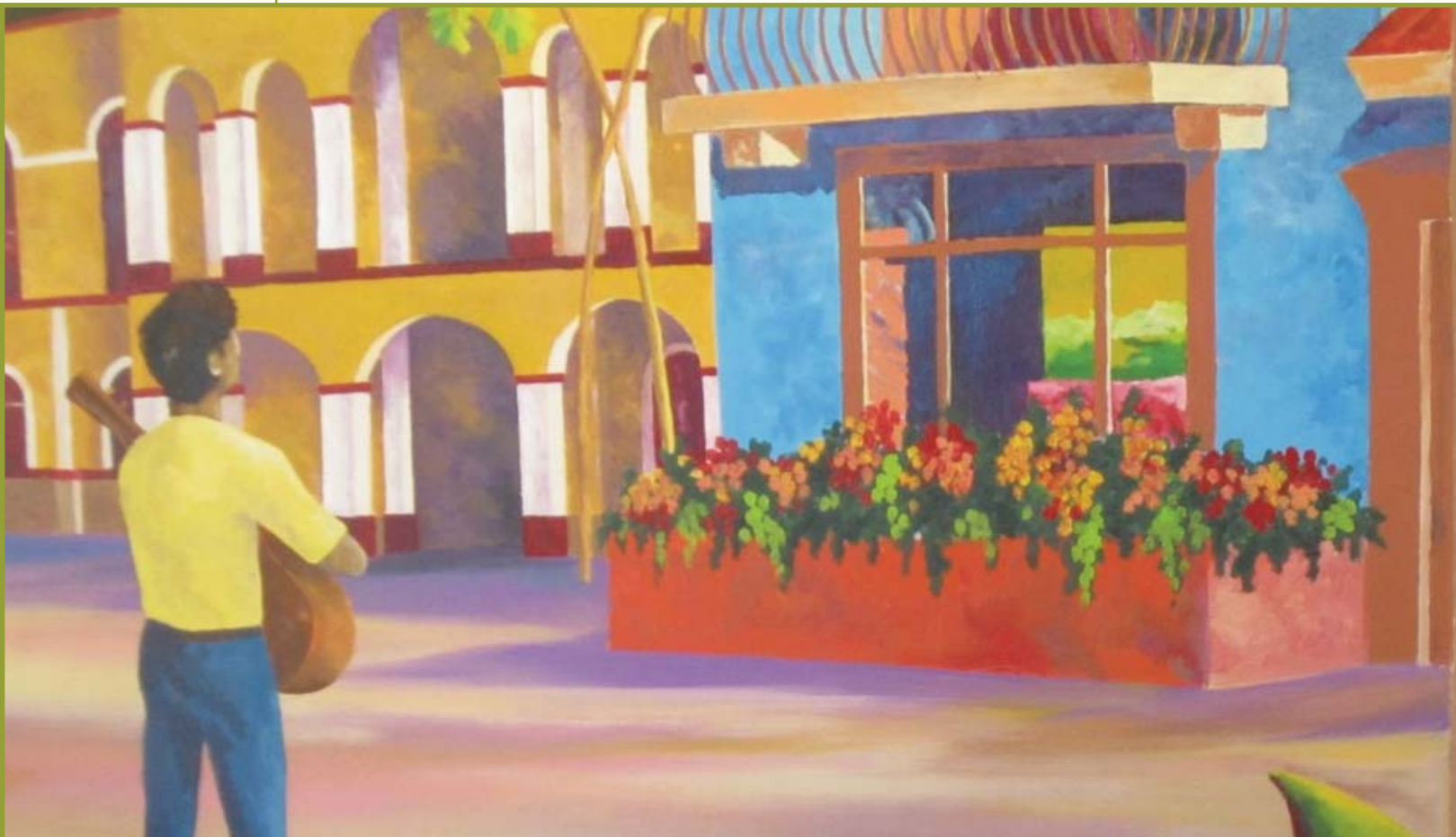
Centro Hispano lobby mural

The Madison Cultural Plan 2011 is a five-year action plan to advance Madison's position as a center for creativity and innovation. The plan looks at the community's arts, science, and history resources and recommends practical steps to strengthen the sector itself, to connect creative work to broader civic issues, and to increase citizen access to creative experiences. It is about bolstering the interplay of artists, creative workers, arts and cultural institutions, and creative commercial enterprises with one another and with their consumers, donors, and investors.