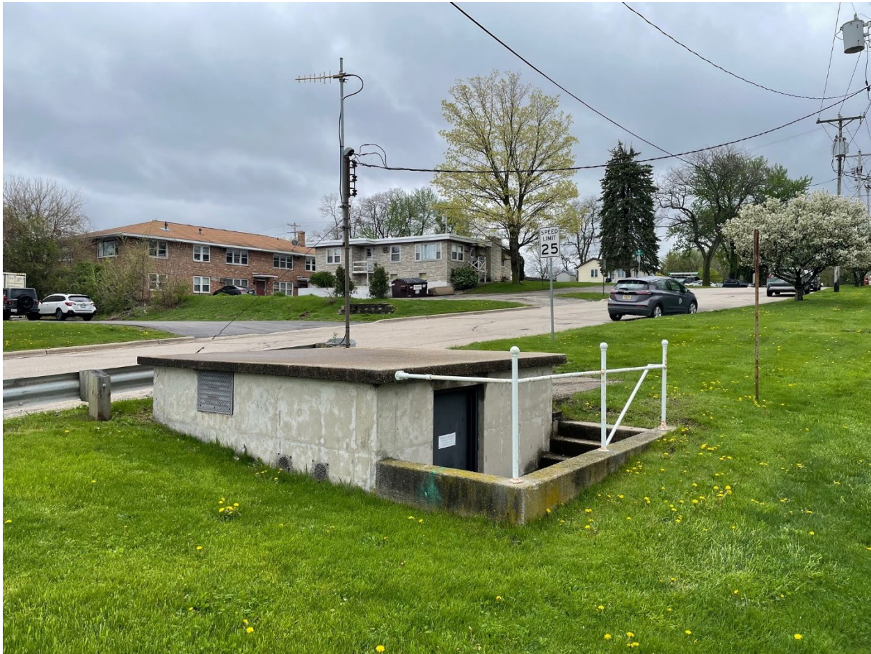
Figure 1: Existing Badger Ln Lift Station

The pumps are currently located in an underground containment structure. The original construction drawing of the lift station is not available but a site visit to view the station internals will be made available to Consultants. Enclosed is a map showing the location of the existing lift station.