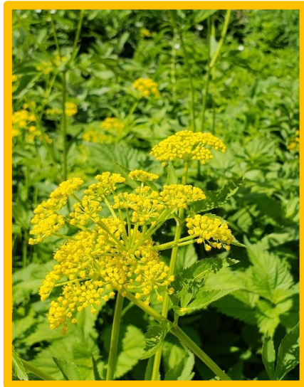
Golden alexanders ( Zizia aurea )