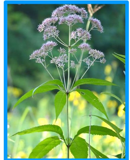
Sweet joe-pye weed ( Eutrochium purpureum )