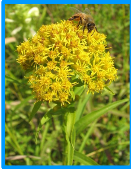
Ridell's goldenrod ( Oligoneuron riddelli )