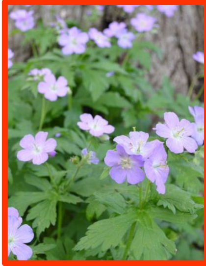
Wild geranium ( Geranium maculatum )