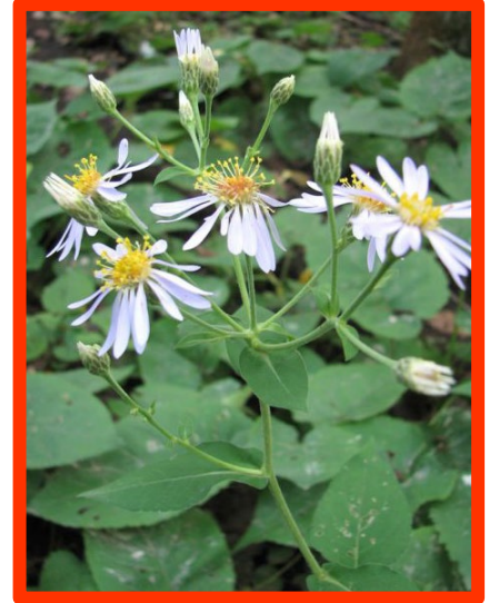
Big-leaved aster ( Eurybia macrophylla )