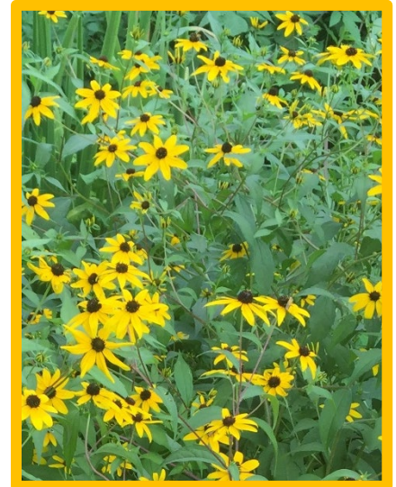
Sweet black-eyed Susan ( Rudbeckia subtomentosa )