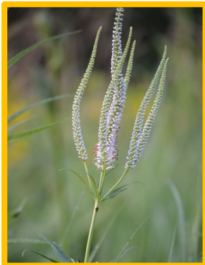
Culver's root ( Veronicastrum virginicum )