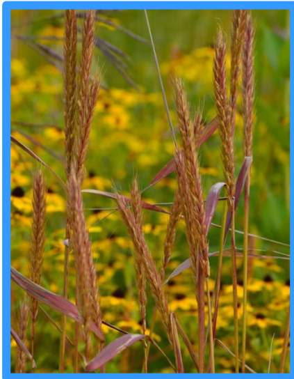
Virginia wild rye ( Elymus virginicus )