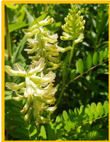
Canada milkvetch ( Astragalus canadensis )