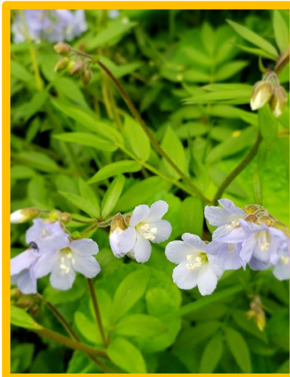
Jacob's ladder ( Polemonium reptans )