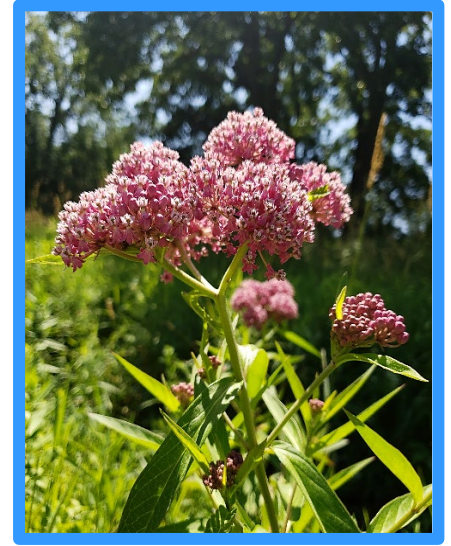
Swamp milkweed ( Asclepias incarnata )