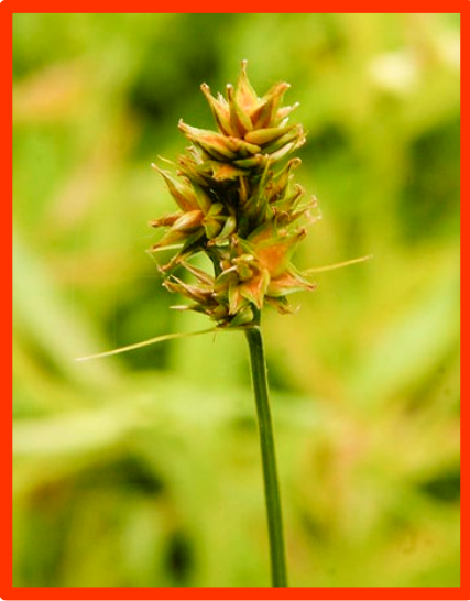
Plains oval sedge ( Carex brevior )