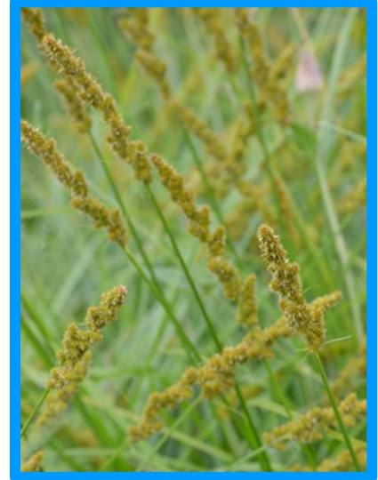
Brown fox sedge ( Carex vulpinoidea )