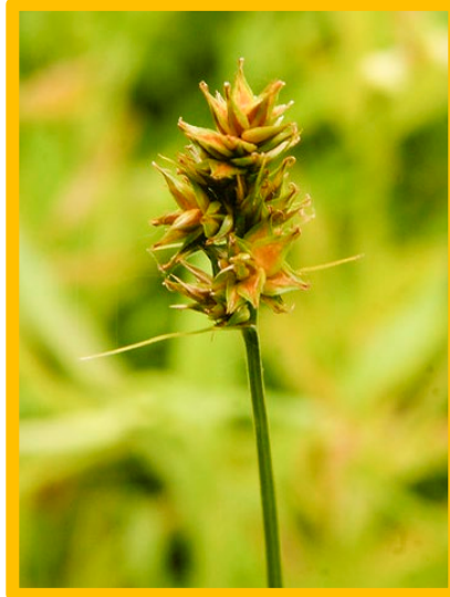
Plains oval sedge ( Carex brevior )