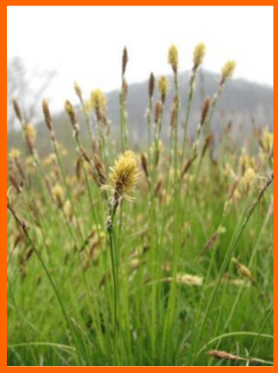
Pennsylvania sedge ( Carex pensylvanica )

Low-maintenance, short, and easy on the eye: simply sedges.