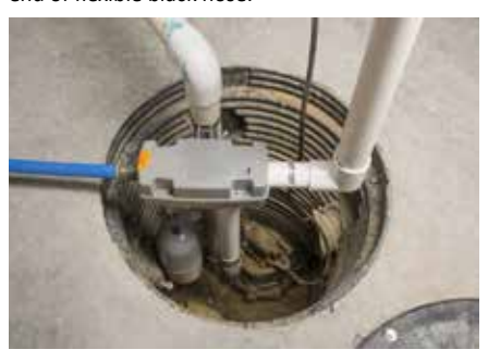
Standard sump "crock" where the water from the perimeter is piped below the floor.