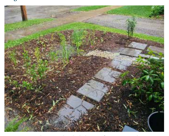
Two near east side rain gardens built during Safer at Home Orders. Residents discovered it doesn't take much to start building a garden – a shovel, tarp or wheel barrow and string. It can be as inexpensive as you choose.