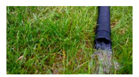
Residential sump pump discharging water from end of flexible black hose.

If you know of a sump pump discharge problem that needs to be fixed, you can report it using the Report a Problem form: cityofmadison.com/reportaproblem/sidewalk.cfm.