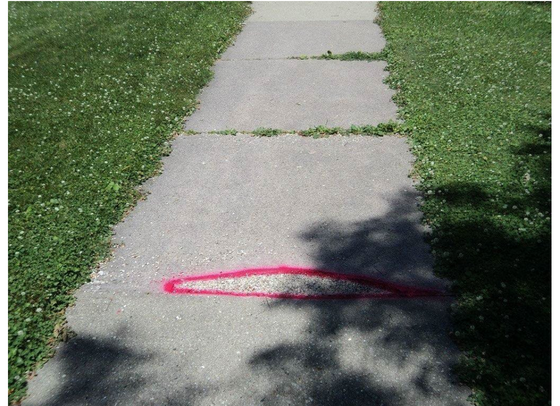
Voids and Erosion of Joints