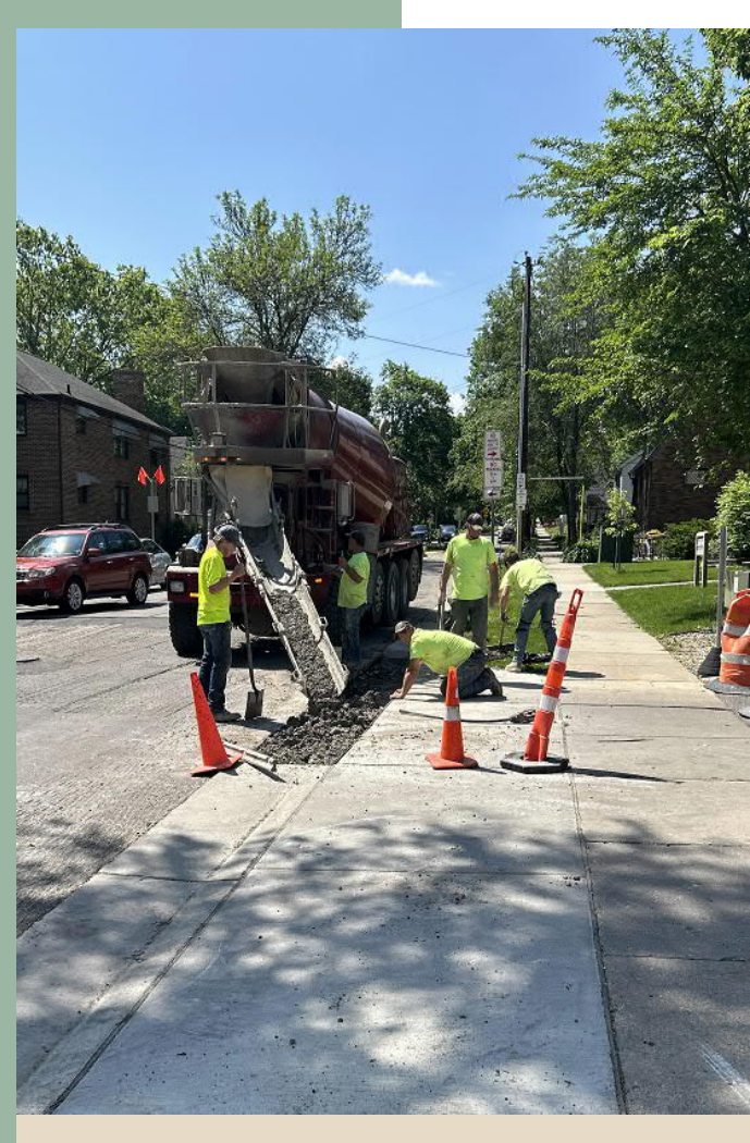
Driveway and Sidewalk Installation