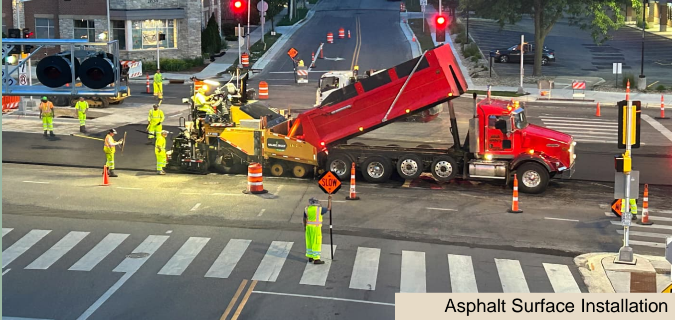
Asphalt Surface Installation (University Bay Dr./Farley Ave.)