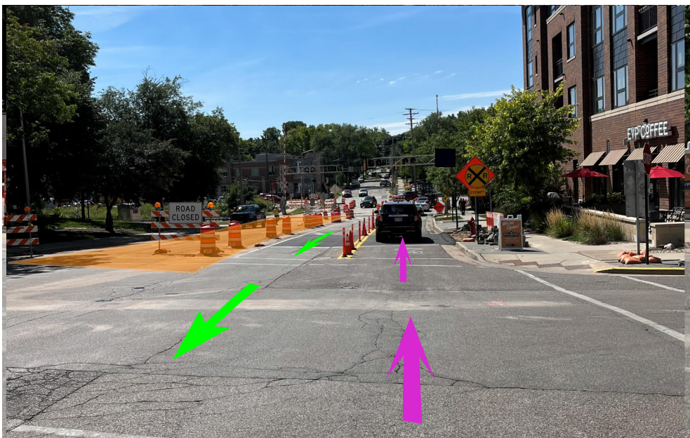
UNIVERSITY BAY DRIVE SINGLE LANE (LOOKING SOUTH)