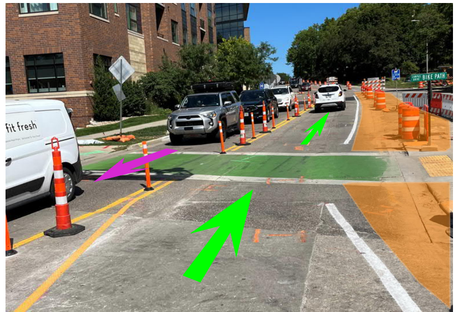
UNIVERSITY BAY DRIVE SINGLE LANE (LOOKING NORTH)