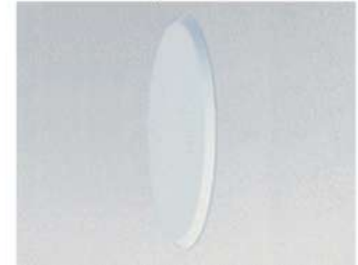
Concealed Sidewall Sprinkler