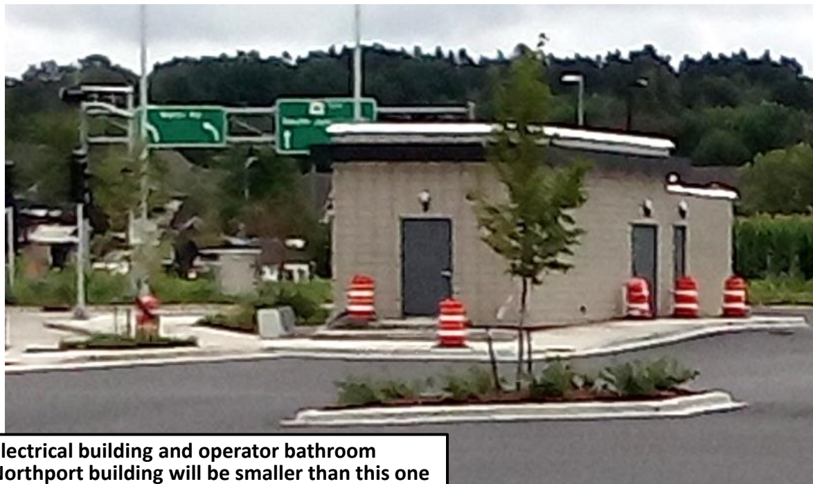
Electrical building and operator bathroom Northport building will be smaller than this one