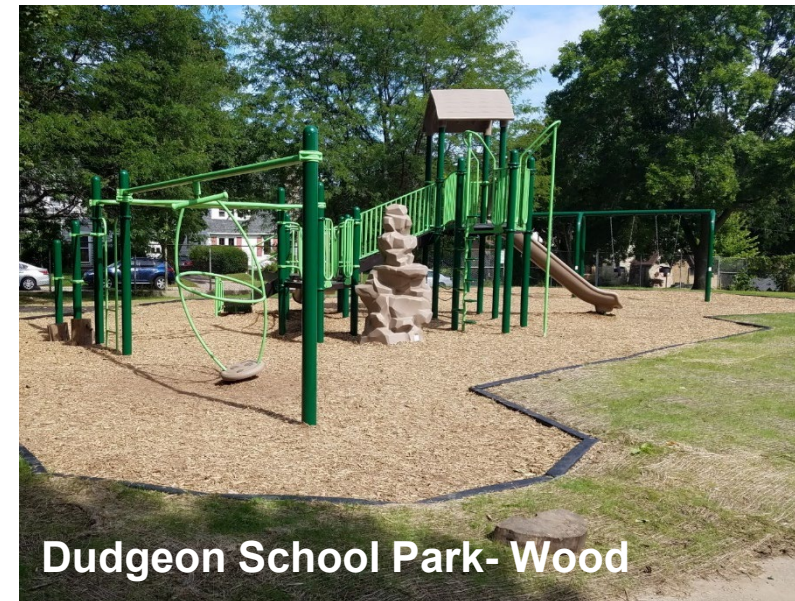
Dudgeon School Park- Wood