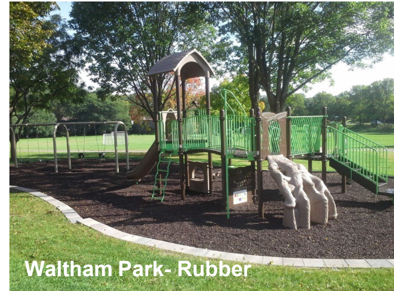
Waltham Park- Rubber