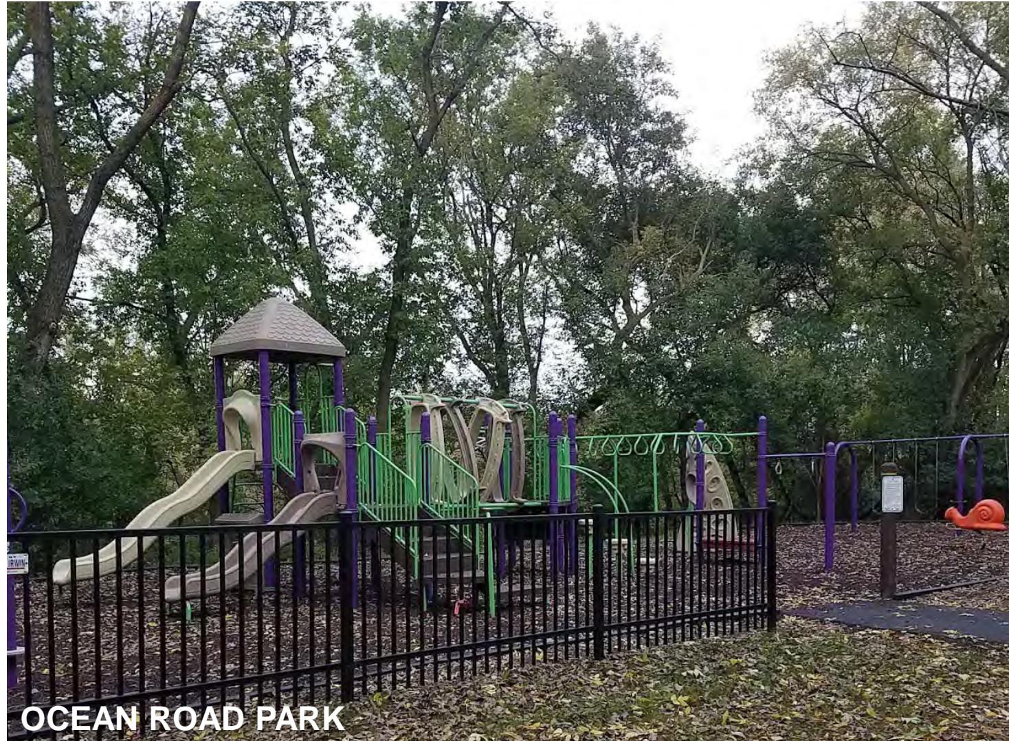
OCEAN ROAD PARK