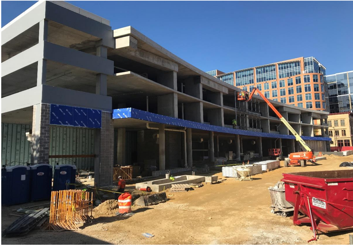
An image from the southeast corner of South Pinckney St and East Wilson St looking northwest.