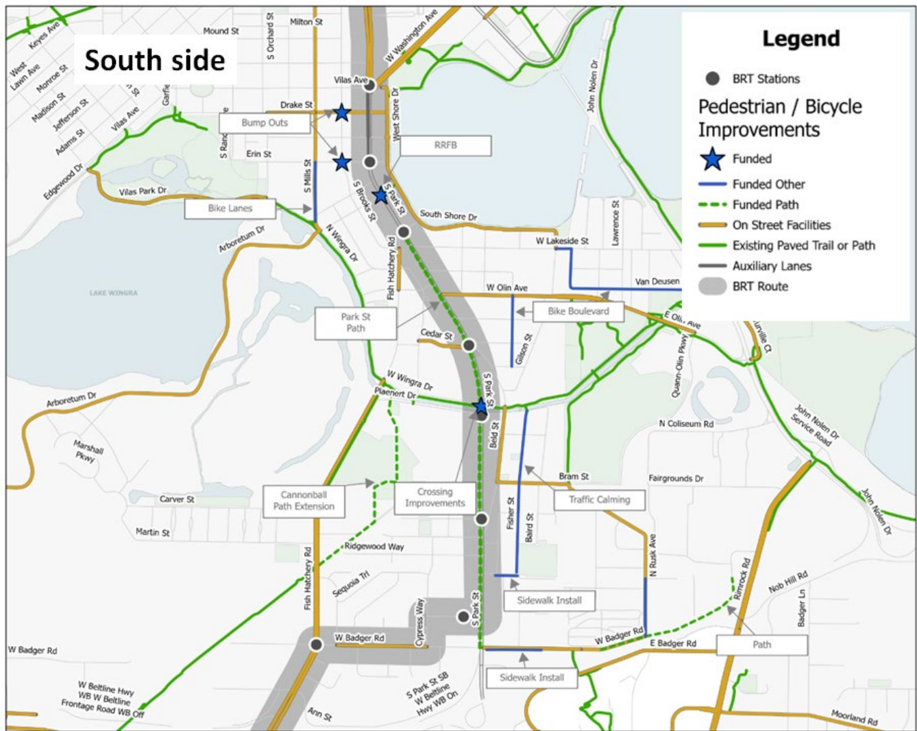
Figure 1.1b Existing Bicycle Facilities along and near Rapid Route B – South Side