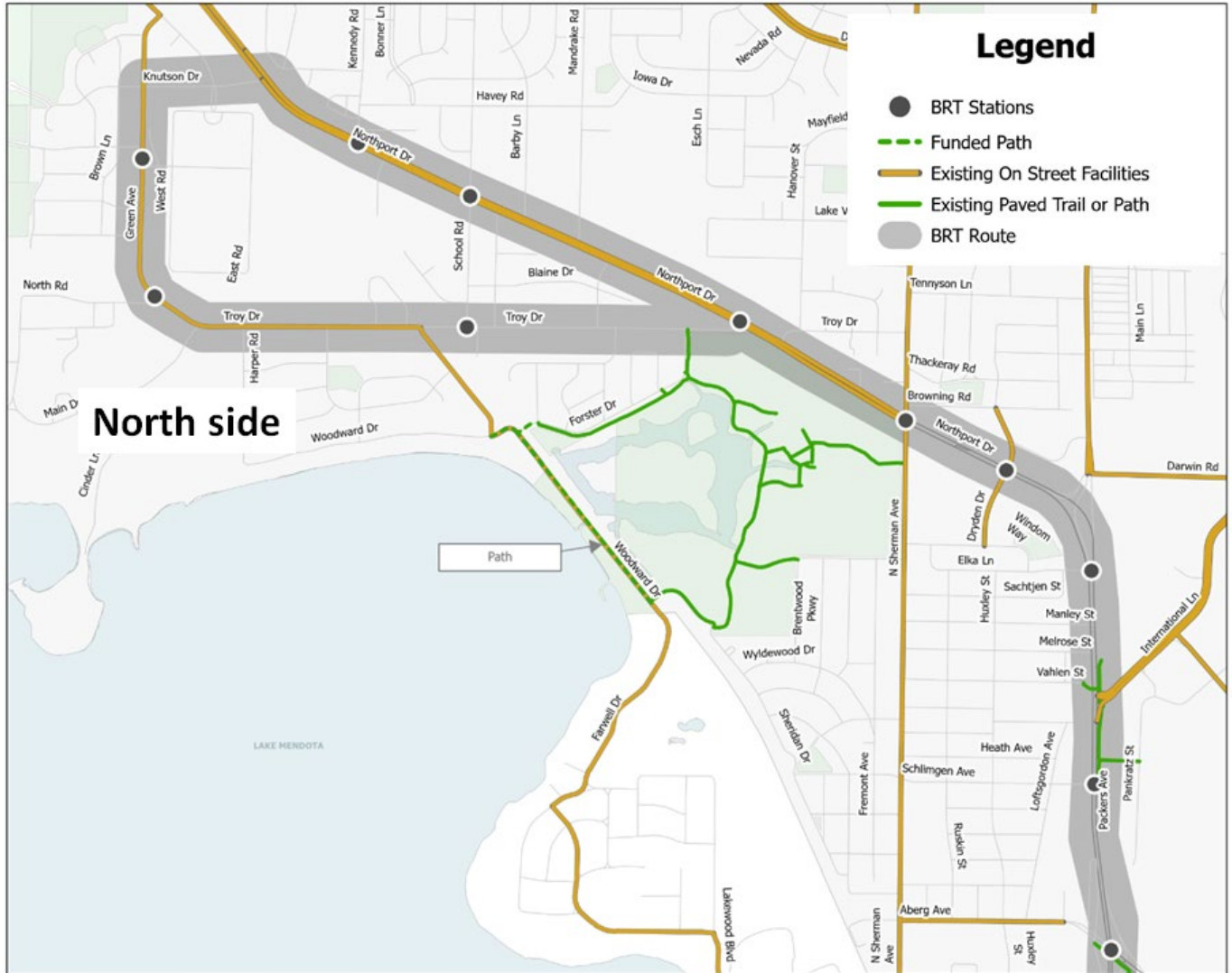
Figure 1.1a Existing Bicycle Facilities along and near Rapid Route B - North Side