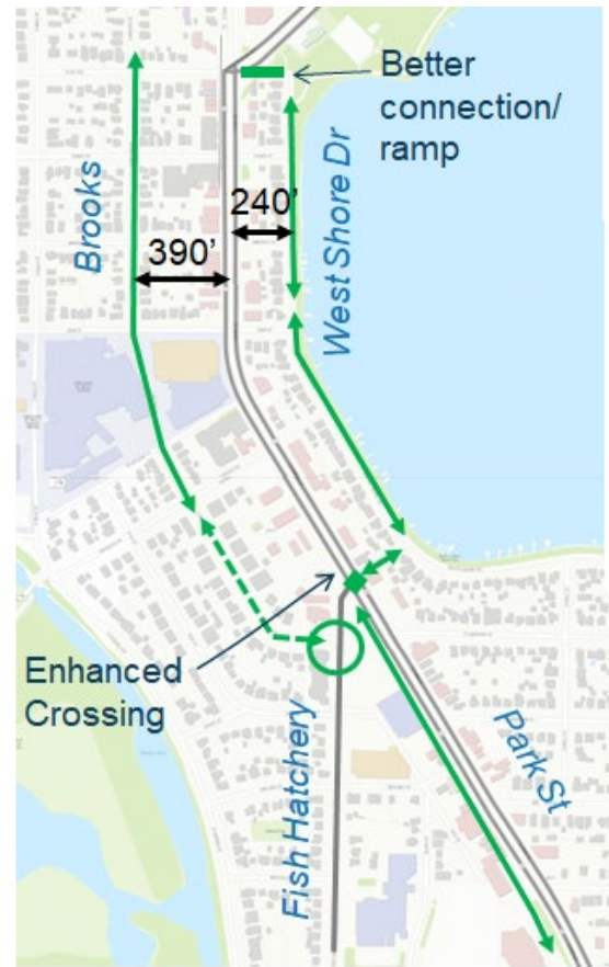
Figure 3.3 Strengthened parallel connections

With the placement of the shared use path on the west side of Park St, crossing connections to the west side of the street will be strengthened. This includes installing two new traffic signals, reducing speeds, and installing continental cross walks.